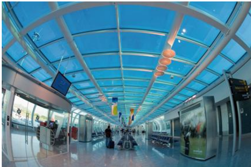
Brazil: TROX swirl diffusers distribute fresh air to the halls and corridors of Rio de Janeiro's Santos Dumont Airport.