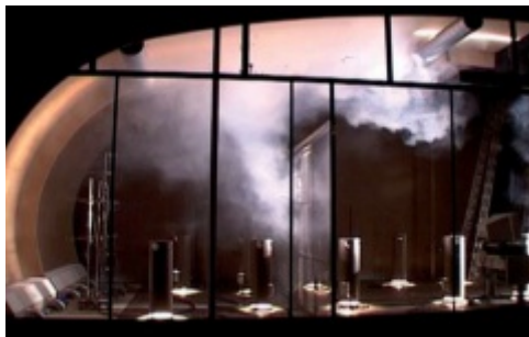
Airflow tests: Mock setup in the TROX research & development laboratory