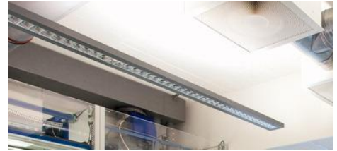
LABORATORY TECHNOLOGY DEMO ROOM