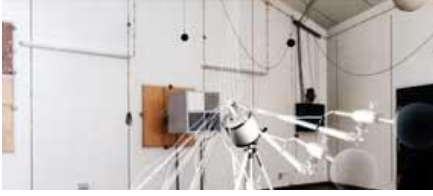
MEASUREMENTS ON SOUND ATTENUATORS ACOUSTICS