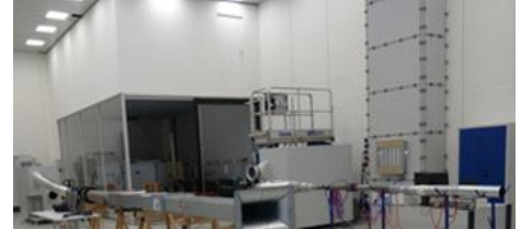
TEST FACILITIES CONTROL TECHNOLOGY