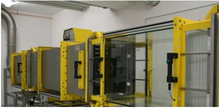
FOR HIGHEST DEMANDS FILTER TECHNOLOGY