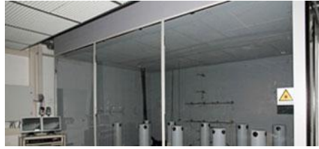
TEST FACILITIES AIR DISTRIBUTION TECHNOLOGY