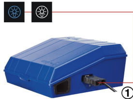
BUTTONS ON THE CONTROL PANEL TO SWITCH THE LIGHTING ON/OFF