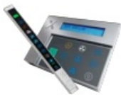
Beleuchtungsschaltung über Bedieneinheit