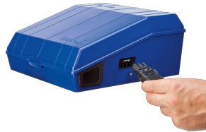
CONNECTION SOCKET FOR LIGHTING