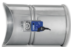
CONNECTION TO CIRCULAR DUCTS