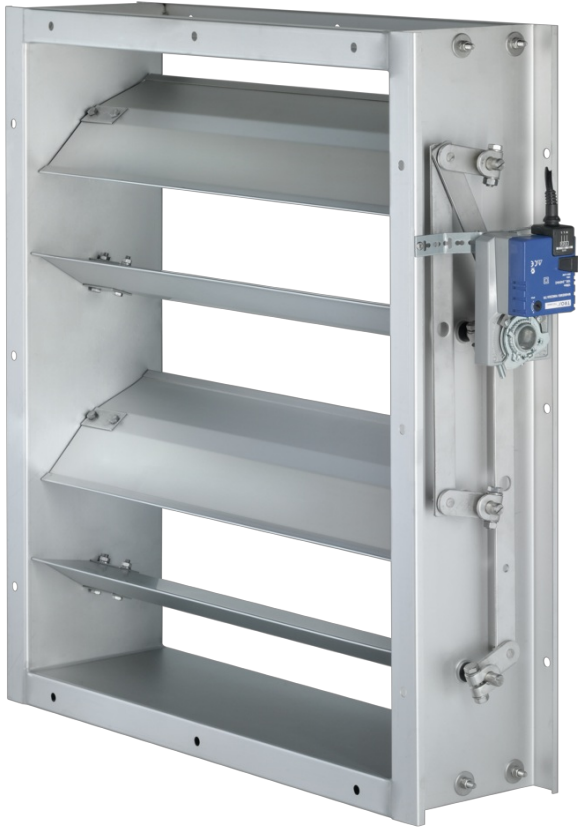
Multileaf damper with actuator