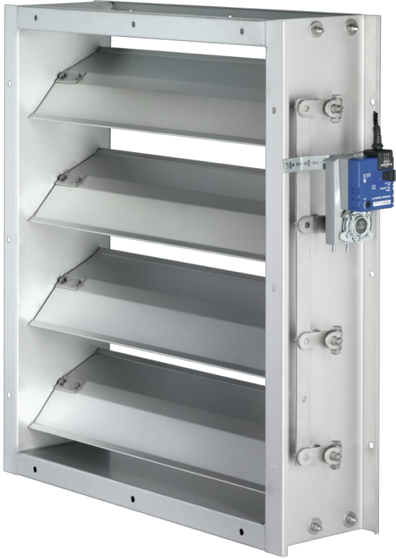
Multileaf damper with actuator