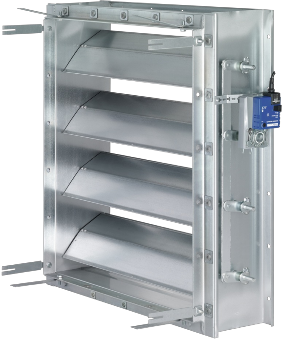
Multileaf damper with installation subframe and actuator