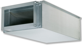
SECONDARY SILENCER TYPE TS