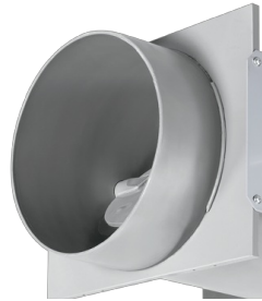
VARIANT WITH CIRCULAR SPIGOT