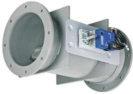
PLASTIC SHUT-OFF DAMPER WITH FLANGE (AKK-FL)