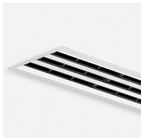
INSTALLATION IN CONTINUOUS CEILINGS

Nominal length up to 1500 mm: one spigot