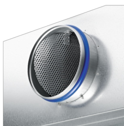
PLENUM BOX WITH DAMPER BLADE (OPTIONAL)