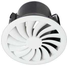
Circular swirl diffuser with spigot for connection to a vertical duct