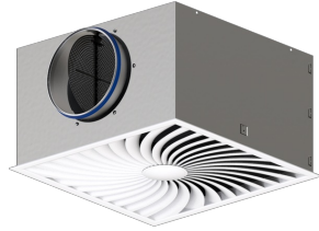
Square face style with square plenum box