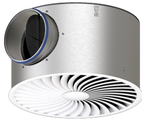
Circular face style with circular plenum box