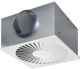
SQUARE DIFFUSER FACE WITH SQUARE PLENUM BOX

Circular diffuser faces with circular plenum box